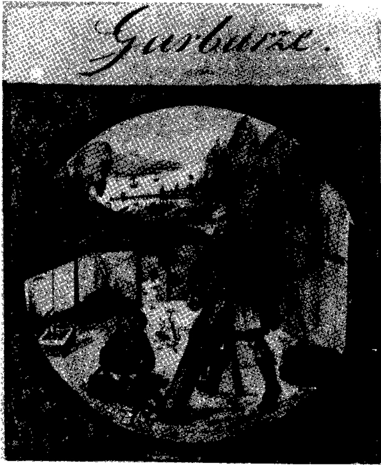
A CRACOW TANNERY in 1505 ( Codex of Baltazar Behem ).