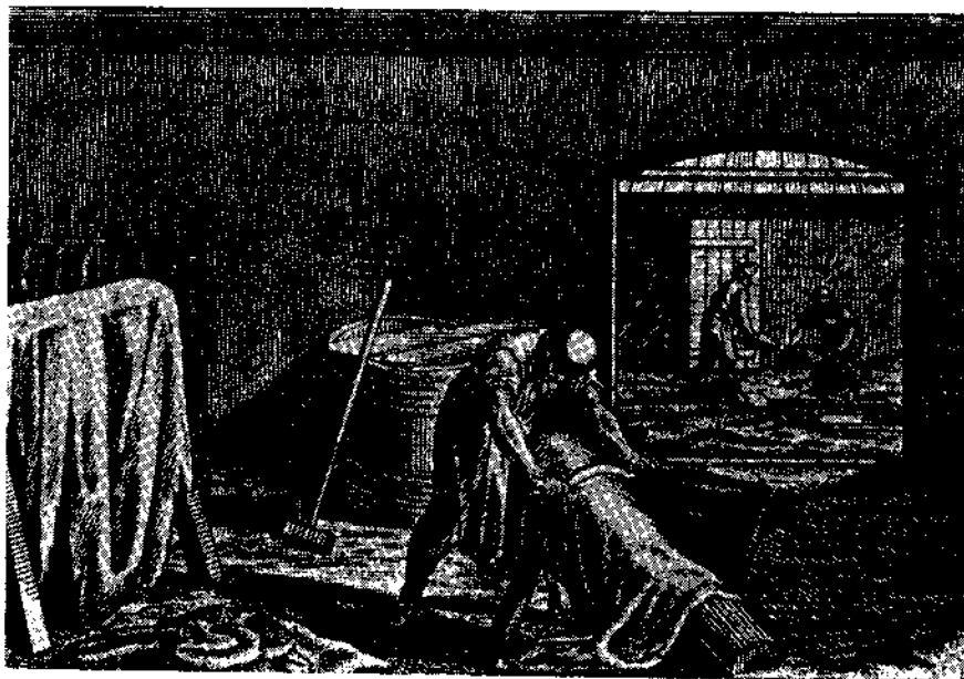
DANIEL CHODOWIECKI, A TANNERY (1770).