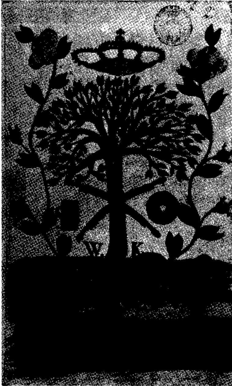
A drawing extant on the register of the Cordovan artisans' guild in Cracow shows the most important tannins and tools: the bush of a tanning herb, a currycomb, a brush, a smoothing wheel and two crossed knife scrapers. Manuscript No. 1219 in the Library of the Polish Academy of Sciences, Cracow.